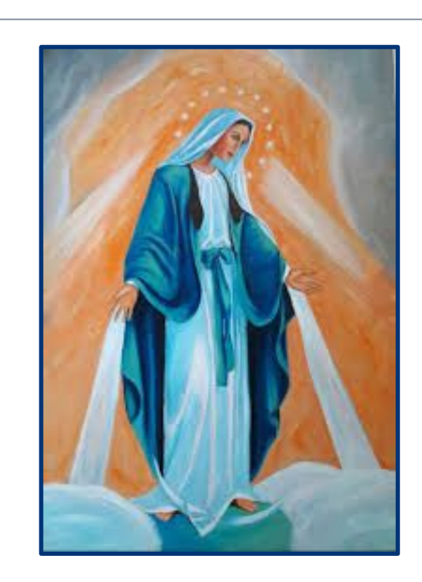
MARY, OUR MOTHER