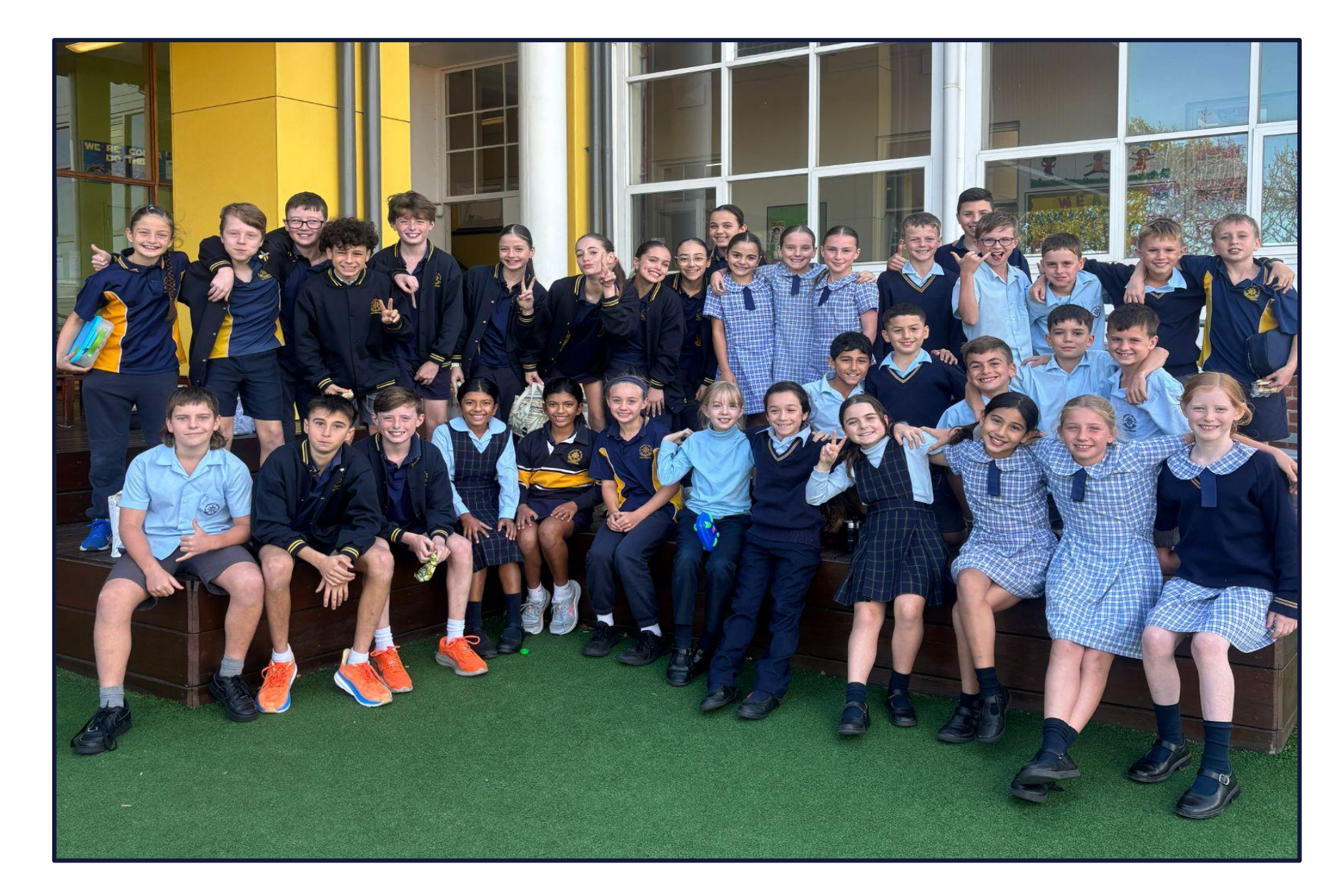
District Cross Country Team

Congratulations to the 91 students across Years 4 - 6 who tried out for the District Cross Country team in Week 2. The Year 4 students completed a 2km trial whilst the Year 5/6 students completed a 3km trial. We wish all students competing in the District Cross Country event at Maribyrnong Park all the best on the 20th of May in their races.