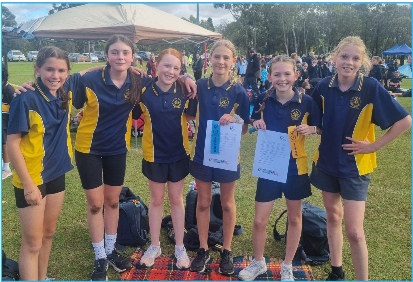
Some of the Cross Country team members