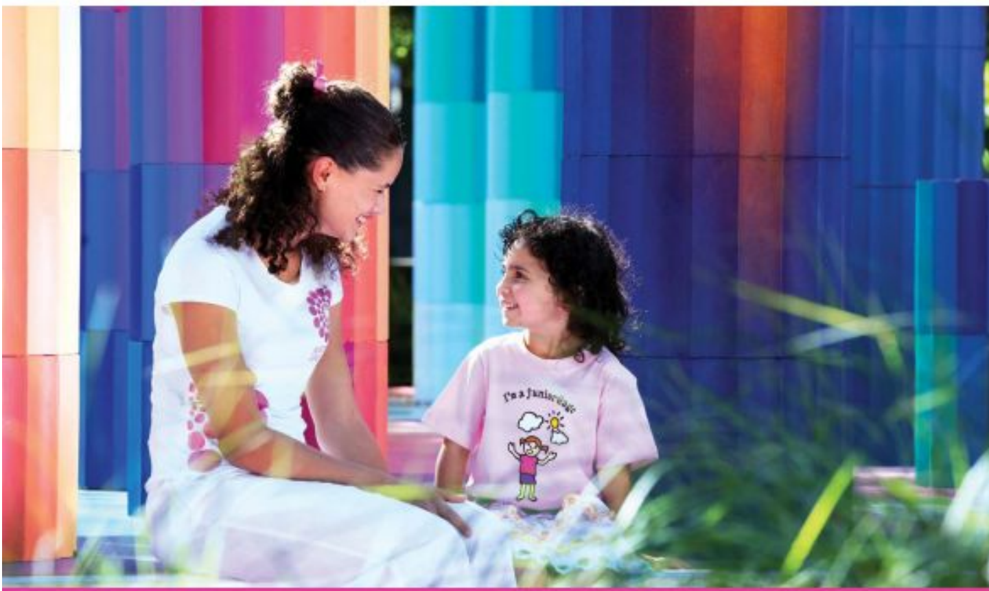
An experience that goes far beyond the stage!

Girls blossom as members of the AGC, both on and off the stage. Your daughter will develop confidence, public speaking and presentation skills, resilience and friendships that will last a lifetime. Our senior performers have shared the stage with a long list of artists including Hugh Jackman, Amy Shark and Kylie Minogue. We are proud to have represented Qantas for 25 years in the iconic 'I Still Call Australia Home' advertising campaigns and at hundreds of live events. Now accepting Semester 2 enrolments for our rehearsal venues in Berwick, Box Hill, Caulfield North, Cheltenham, Essendon, Glen Waverley, Greensborough, Heidelberg, Ivanhoe, Kew, Ringwood and Yarraville.